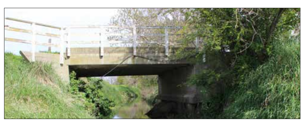
Bridges and culverts are the best way to get stock over streams.

Extensive farms, such as high country sheep and beef operations should monitor pugging at key crossing and drinking water sites. Stock should be removed from the area if pugging is occurring.