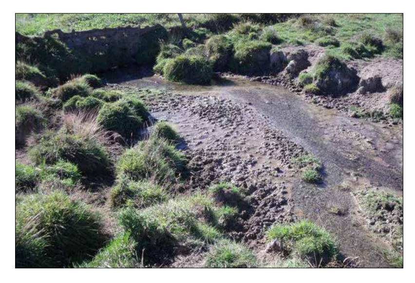
Deer had unrestricted access to this waterway causing damage to the bed and banks. This is a breach of permitted activity conditions.

At right: this is a major breach of the stock access permitted activity conditions and the sediment rules.