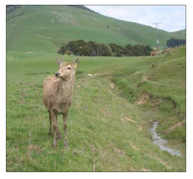
The deer are starting to cause pugging and sedimentation, they need to be fenced out of this waterway, or removed from the paddock.