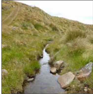
Extensive grazing in high country areas will often meet the permitted conditions without the need for fencing of all waterways.

Stock are excluded from this stream-bank by a simple fence. As a result there is no pugging, slumping or erosion and no change in colour or clarity of the river.