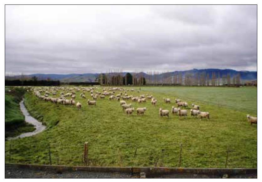
The stock access permitted activity conditions are met in this area where sheep have not caused any damage to the stream-bank. But keep an eye out for any change to the conditions and remove the stock or fence-off immediately if damage starts to occur.

To ensure that you are meeting the rule, regularly check your waterways for damage and remove stock if they are causing any damage.