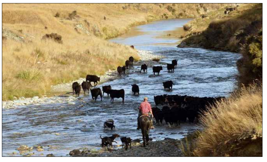
Driving calves through the stony bottom reaches of the upper Pomahaka River. Although driving stock through waterways is not encouraged, in some cases, such as this, the permitted activity conditions are met.

You will have breached the rules by allowing stock access to the waterway if this causes a visible change in water colour or clarity (such as a sediment plume or cloudiness).