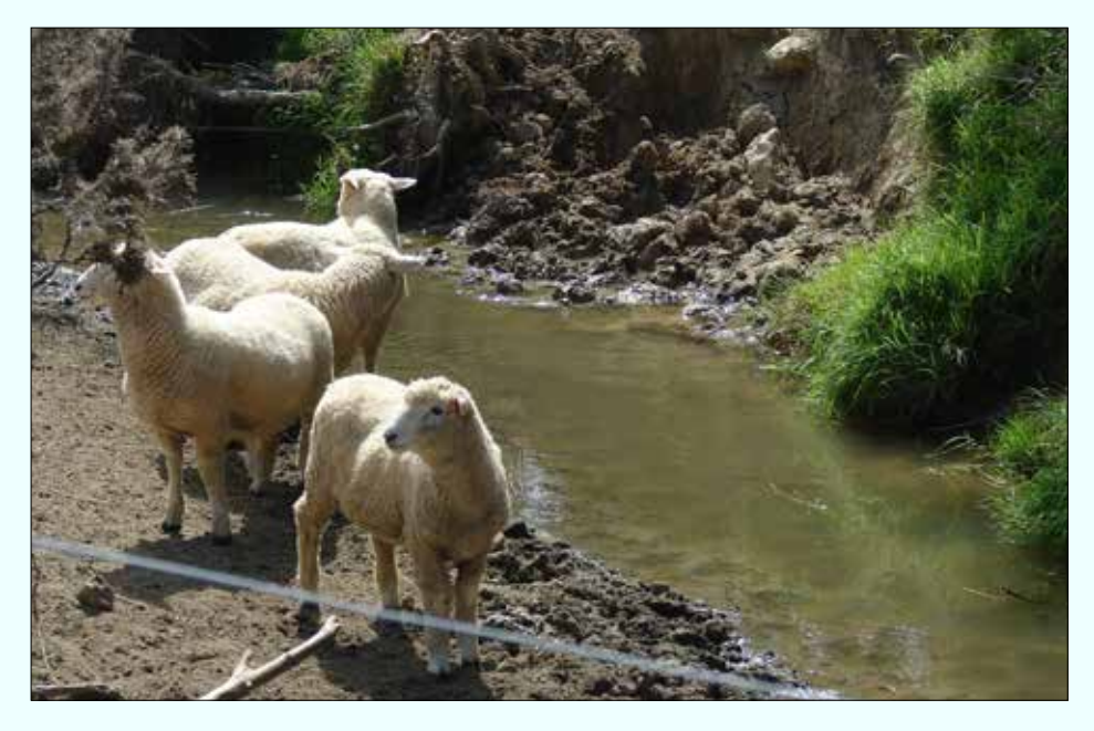
These sheep have caused pugging and erosion and have created an obvious change to the colour and clarity of this stream. This is a breach of the permitted activity rules and is not allowed without consent.

If damage is occurring you will need to exclude stock immediately. Be proactive, and avoid this situation by excluding stock from waterways where damage is likely to occur. It is not just large rivers and streams, also watch for damage on your smaller creeks and tributaries.