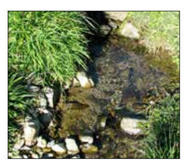
A healthy stream

If you are unable to meet these conditions you will need to exclude stock from the waterway or apply for a resource consent.