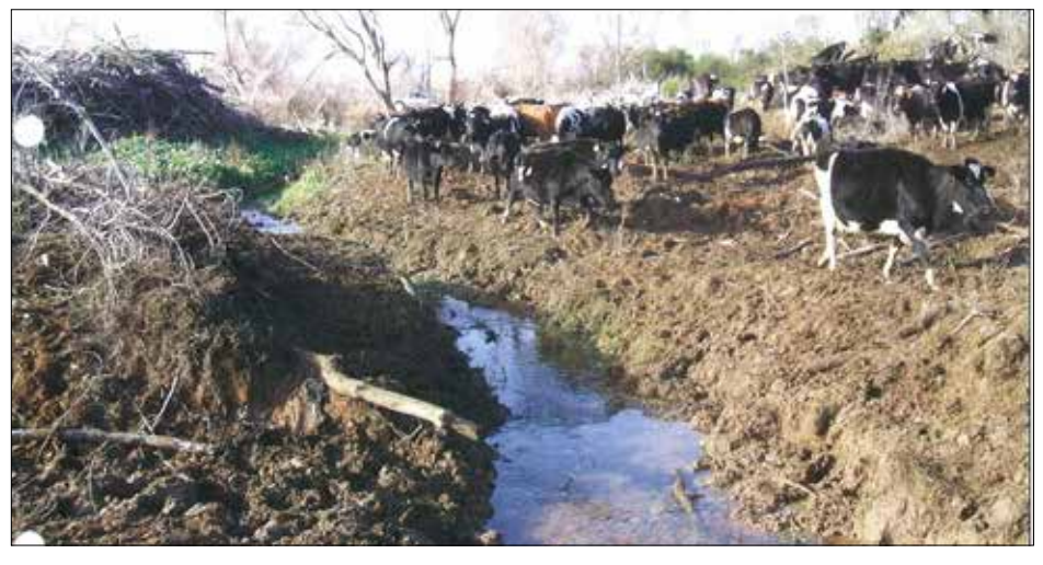
These cows have caused significant pugging, slumping and erosion. Even if you are only wintering dairy cows on your farm, make sure your fencing is adequate and they do not cause damage to waterways.

To ensure that you are meeting the rule, regularly check your waterways for damage and remove stock if they are causing any damage.